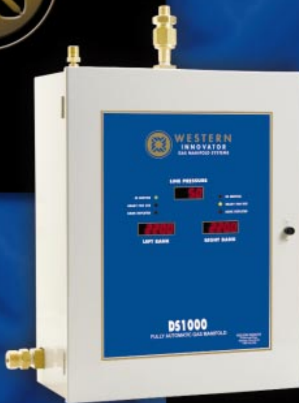
DIGITAL MANIFOLD DS1000